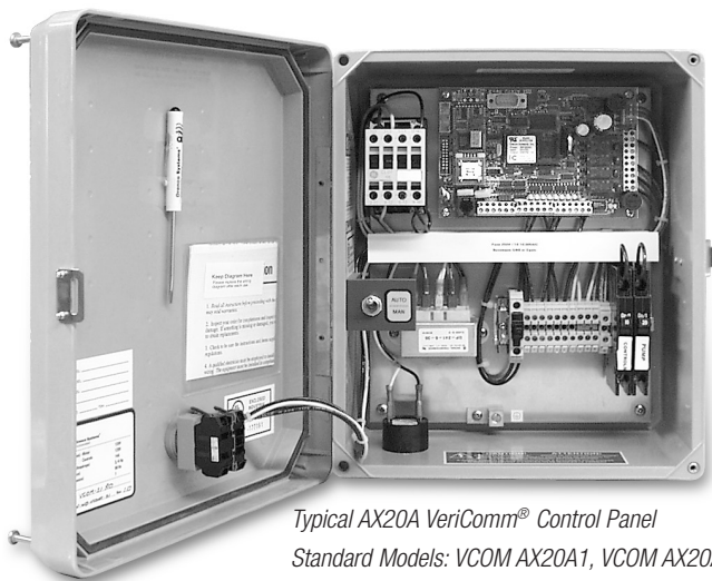
Typical AX20A VeriComm ® Control Panel Standard Models: VCOM AX20A1, VCOM AX20A2

VeriComm ® AX20A remote telemetry control panels are used in AdvanTex ® AX20 Treatment Systems with single pumps for timed recirculation and with gravity discharge. Coupled with the web-based VeriComm Monitoring System, these affordable control panels give the ability to remotely monitor and control treatment system operation, with real-time efficiency to wastewater system operators and maintenance organizations, while remaining invisible to the homeowner. AX20A panels allow remote operators to change system parameters, including timer settings, from the Web interface.