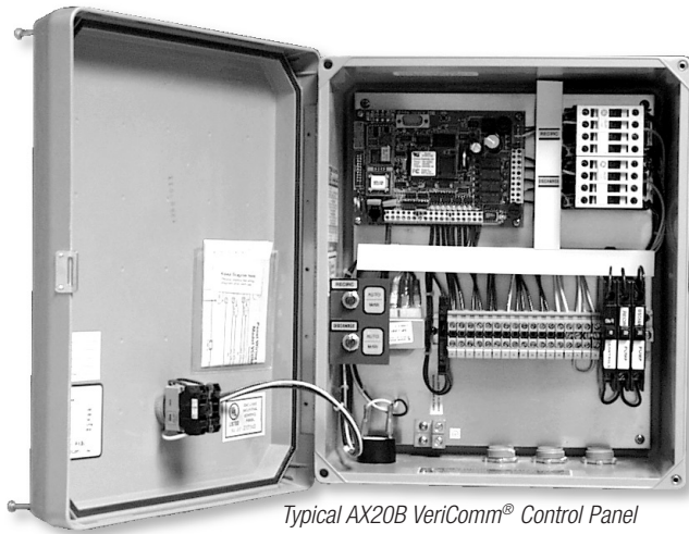
Typical AX20B VeriComm® Control Panel Standard Models: VCOM AX20B1, VCOM AX20B2

VeriComm® AX20B remote telemetry control panels are used in AdvanTex® AX20 Treatment Systems with two pumps for timed recirculation and pump discharge. Coupled with the web-based VeriComm Monitoring System, these affordable control panels give the ability to remotely monitor and control treatment system operation, with real-time efficiency to wastewater system operators and maintenance organizations, while remaining invisible to the homeowner. AX20B panels allow remote operators to change system parameters, including timer settings, from the web interface. Interlocked controls prevent recirculation pump operation if there is a high-level alarm on the discharge side.