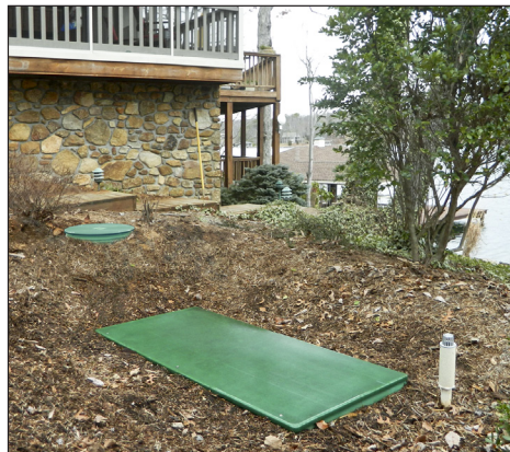
A typical AX20-RT system installation. Note the system's small footprint. The AX20-RT measures 8.5 x 6 x 5.2 ft (2590 x 1830 x 1575 mm).

The homeowners asked engineer Kevin Davidson of Agri-Waste Technology to come up with a solution. Working with Todd Harrell, Orenco's Area Sales Manager, Davidson suggested to the DWQ that the homeowners install an AdvanTex AX20-RT with UV. The AX20-RT with UV provides an extremely high level of wastewater treatment and uses a packed-bed media filter and ultraviolet disinfection to clean wastewater to better than secondary treatment standards.