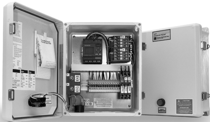
Orenco® MVP-DAX1DM control panel accommodates both timed- and demand-dosing applications