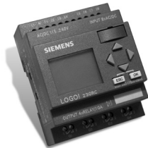
The programmable logic unit is the brain of the MVP-Duplex control panel

Orenco's MVP-Duplex control panel has a dual-mode feature, making it ideal for both timed- and demand-dosing in two-pump alternating systems. All MVPs include an easy-to-use, programmable logic unit that incorporates many timing and logic functions, such as multiple timing intervals to adjust for changing flow conditions and a built-in elapsed time meter and counter.