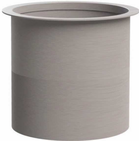
Orenco®'s flanged fiberglass access risers are available in 36- and 48-inch (900- and 1200-mm) diameters.

Orenco Fiberglass Access Risers are constructed of filament-wound fiberglass to be lightweight, corrosion resistant, and extremely strong. Flanged risers are available in 36- and 48-in. (900- and 1200-mm) diameters, with lengths available in 3-in. (75-mm) increments. They have an integral top flange with threaded bronze inserts for securing access riser lids.