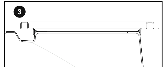
Installation for 1000-2000-gal. tank (cutaway view)