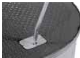
"Slide On" manhole cover (Less Strain, No Pain)