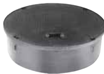
36" manhole with bolted cover