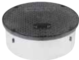
30" manhole with non-bolted cover

EBW's SAFE-LITE FRC (Fiber Reinforced Composite) manhole covers are ultra lightweight. The composite construction has been engineered and tested to exceed the D.O.T. H20 load ratings. These lightweight covers are approximately 1/3 the weight of steel covers of the same size. The lightweight covers dramatically reduce injury potential during cover removal. SAFE-LITE FRC manholes are available in 30", 36", & 42" sizes. The Slide Action Cover further reduces the chance of injury by eliminating the need to bend down to remove or replace the cover.