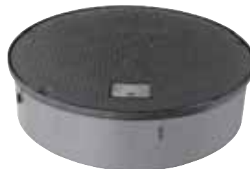
42" manhole with slide on cover