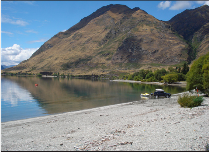
Although Lake Wanaka offers many recreational activities — such as boating, fishing, and swimming — it is also a source of drinking water. Protecting this water from contamination was a driving factor in the decision to install an Orenco wastewater treatment facility.

The lake is not only enjoyed for recreational pursuits, but is also a source of drinking water for the surrounding areas. Consequently, ensuring the purity of Lake Wanaka is a major concern. But there was a risk of contamination from the park's old and failing wastewater systems.