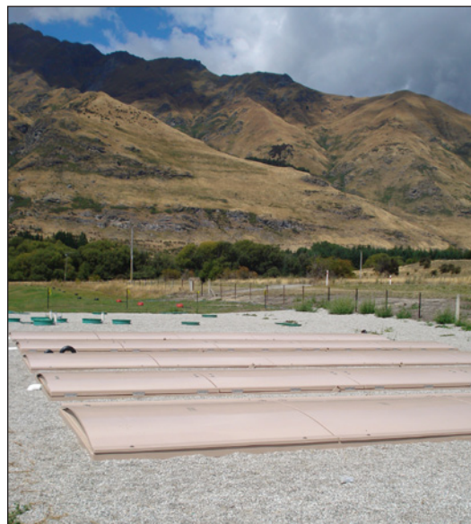
Whether installed above or below the ground, the sand-colored AX-Max units emit no odor or sound and thus draw no attention from passersby.

While enjoying the natural beauty of the area, Glendhu Bay’s many visitors appreciate the conveniences of the campground facilities without ever being aware of the sophisticated wastewater system that makes it all possible. And that is just the way it should be.