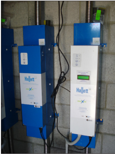
Hallett disinfection units for tertiary treatment.

For tertiary treatment, a fifth AX-Max is used as a polishing unit, followed by ultraviolet disinfection and land treatment (dispersal) with subsurface pressurized distribution lines.