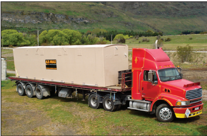
Completely pre-packaged and built inside a durable, insulated, fiberglass tank, an AX-Max™ unit is easy to ship—either by truck, rail, or cargo container.

Even though each of the park's bathroom and shower facilities had its own septic tank, the tanks were quite old and many of them were too small to meet current levels of usage. During the peak summer season, several of the tanks would routinely fail, and effluent would overflow the trenches. Bad odors were common, as was the need for pump-outs.