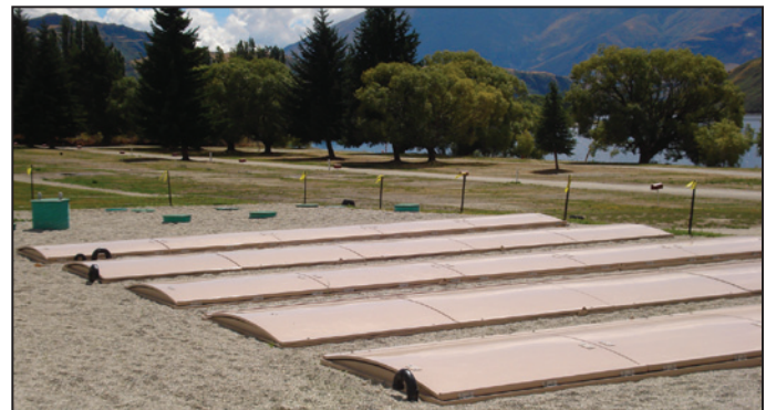
The facility features five Orenco® AX-Max units that employ the AdvanTex® recirculating media filter technology. AdvanTex units produce high-quality effluent with substantial reduction of nutrients, making them well-suited for any project with strict discharge limits.

Total project cost was NZD $1,322,000 + GST (Goods and Services Tax) ... just a little more than $1 million in U.S. dollars. The project involved replacing all but one of the campground's existing septic tanks, as well as linking the new interceptor tanks to an Orenco effluent sewer, which transports the liquid effluent to a central wastewater treatment plant. These watertight interceptor tanks provide passive primary treatment