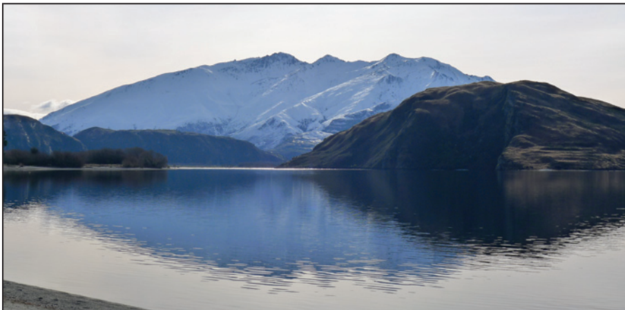
Glendhu Bay Holiday Park is situated on the shores of beautiful Lake Wanaka, New Zealand's fourth largest lake. The park has 400 campsites and lodging for 60.

Although Wanaka, New Zealand might rightly be called a winter vacation destination, it also boasts many year-round activities, such as sky-diving, hiking, fishing, and camping. Among the convenient camping