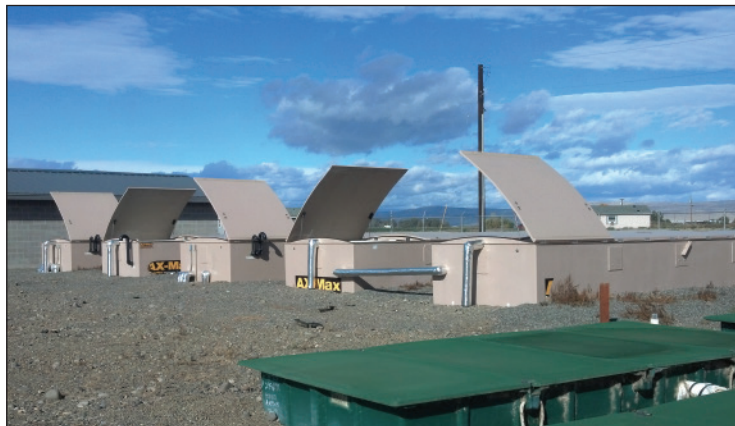
The Yakama Nations Housing Authority in Washington state added five AdvanTex® AX-Max units (background) to its ten AdvanTex AX-100 units, increasing the capacity of its wastewater system by 50%.

Orenco's newest product in the AdvanTex line is the AX-Max™: a completely-integrated, fully-plumbed, and compact wastewater treatment plant that's ideal for commercial properties and communities. It's also ideal for projects with strict discharge limits, limited budgets, and part-time operators.