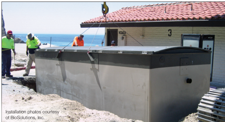
Installation photos courtesy of BioSolutions, Inc.