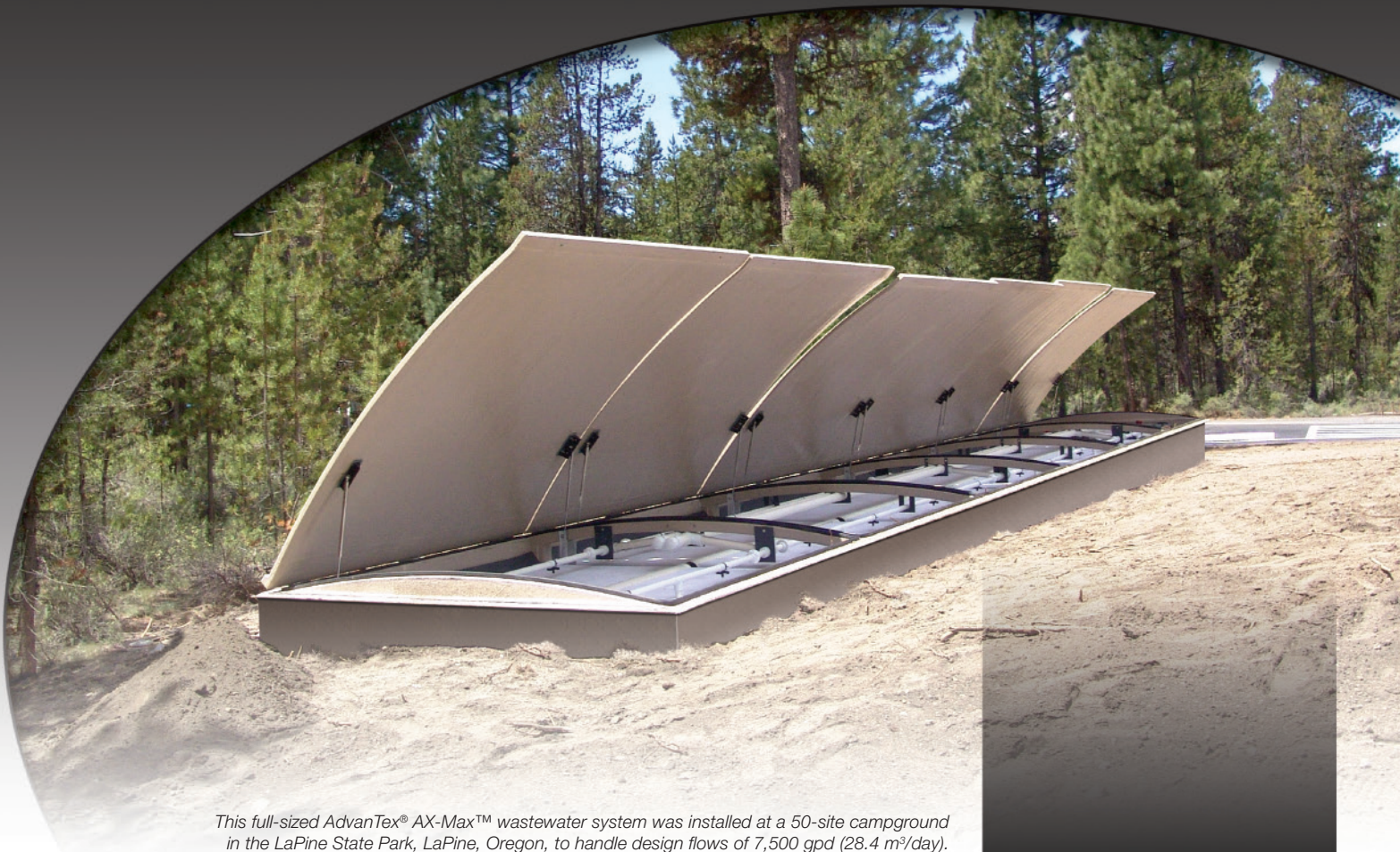
This full-sized AdvanTex® AX-Max™ wastewater system was installed at a 50-site campground in the LaPine State Park, LaPine, Oregon, to handle design flows of 7,500 gpd (28.4 m³/day).