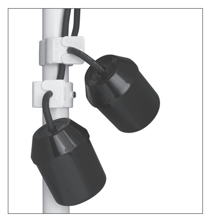
Orenco's float collars make cable ties obsolete. More importantly, they make installations more reliable by keeping liquid level floats separate and secured in position.