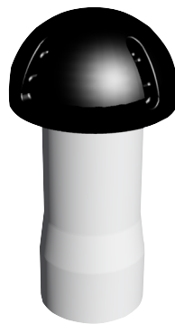
Actual View (side)